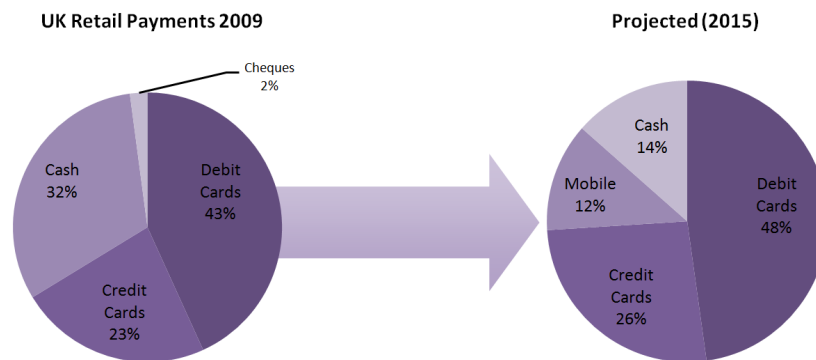
Figure 1 - Changes expected in UK Retail Payments 2006-2015

There are the great unbanked who don't yet have a bank account and who currently rely heavily on cash, but as we will see with M-PESA and G-Cash (Chapter 6), this is hardly a hurdle for mobile cash and payments. The success of the Octopus card in Hong Kong, T-Money in Korea, Edy and Suica in Japan and other emerging technologies already prove the concept. What would quickly kill the need for cash in its entirety is a technical standard for mobile money that could be adopted globally by network operators and device manufacturers.